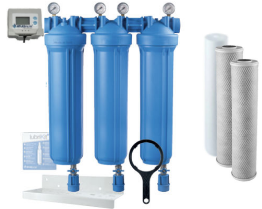
DP Big Trio Plastic Housing Metal Powder Coated White Bracket Filter Wrench and Lubricant